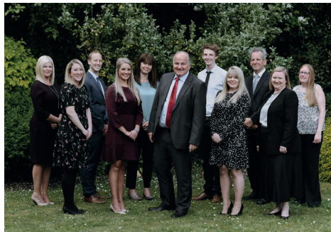
The Kirks team May 2018